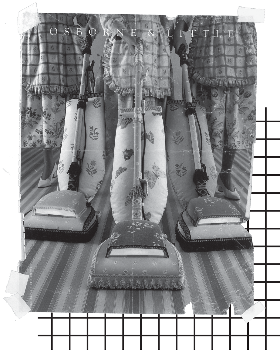
Da coleção/ From the collection "Women and Vacuum Cleaners", Pati Hill, © [c. 1960s-2000s]; Arcadia University Archives, todos os direitos reservados/ all rights reserved.